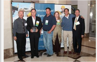
2012 IPI Partnering Champion C.C. Myers, Inc.